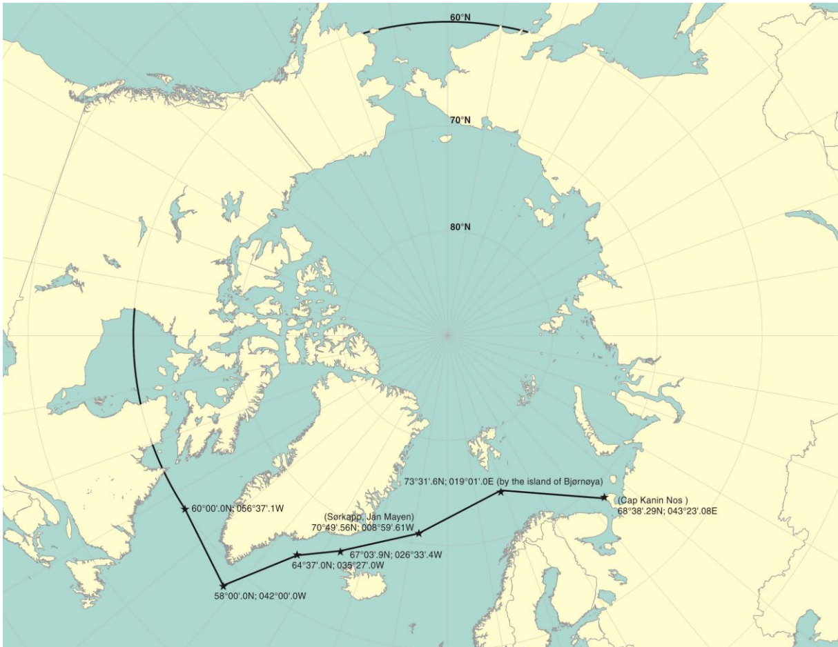
Figure 2 – Maximum extent of Arctic waters application